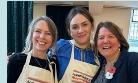
Apples and Borscht event in Leominster