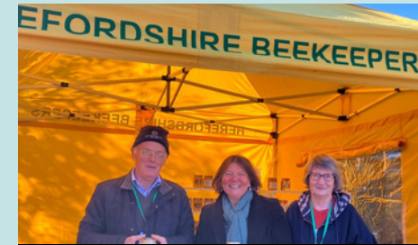
Herefordshire Beekeepers Association