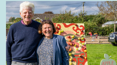
Kingsland Apple Festival