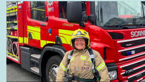
Ledbury Fire Station Open Day