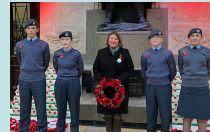
In London with cadets from Herefordshire