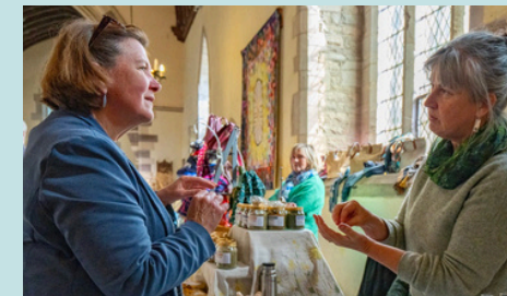
Eardisland Craft & Produce Fair