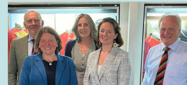
Herefordshire Armed Forces Covenant