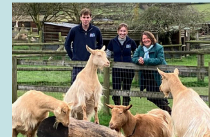
Small Breeds Farm Park near Kington