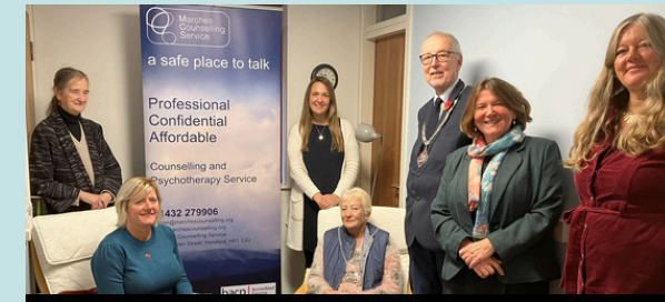
Marches Counselling Service in Bromyard