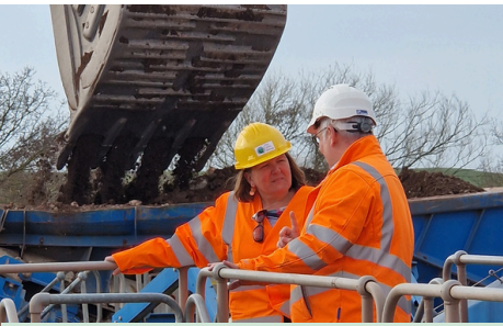
Promoting local industries