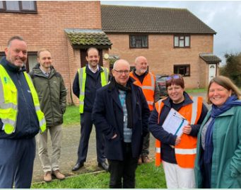
Campaigning for affordable housing