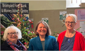
Supporting community events