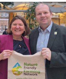
Backing nature friendly farming