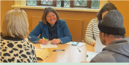
Holding constituency surgeries