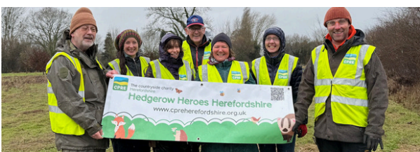
Protecting our countryside