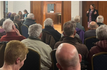
Speaking at public meetings