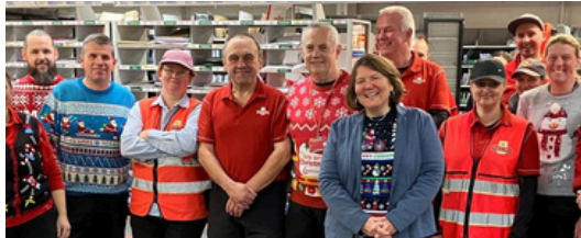
Valuing our posties