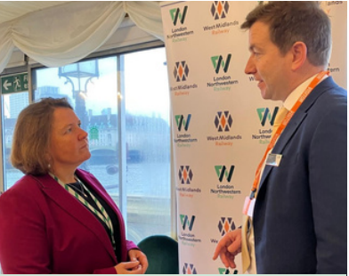
Pushing for better bus & train services