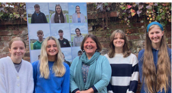
Listening to the next generation